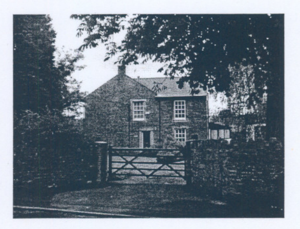
The Rectory (1.9)