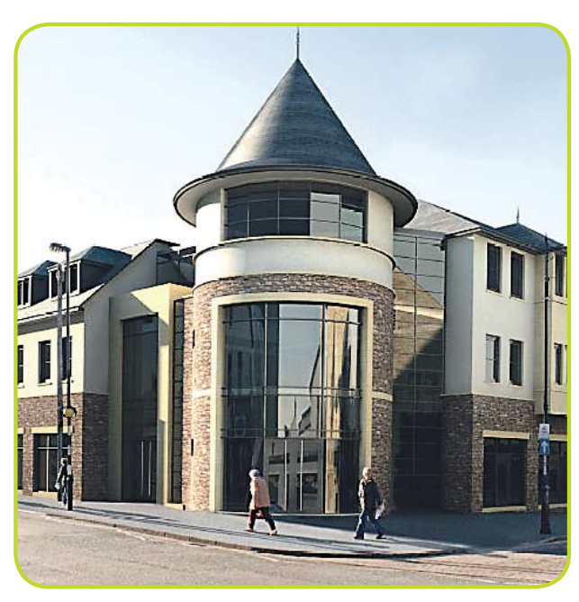
Caerphilly Library & Customer service centre