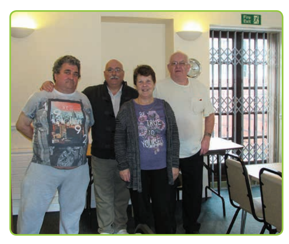
The community group in one of the newly decorated rooms

Caerphilly Homes' single source supply partner, Robert Price Builders' Merchants, donated paint and decorating equipment to the community house along with a brand new timber shed. Volunteers from Wales and West